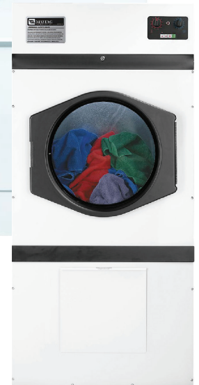
NON VENT MDG75MNWWW pictured