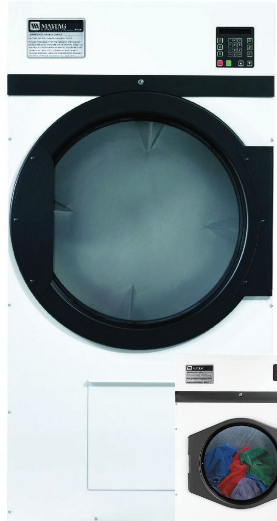
NON VENT MDG75PNJVW pictured

*Exception: MDG75MNWWW offers Mechanical Controls with easy-to-use knobs