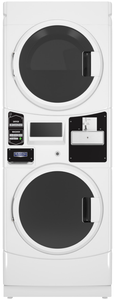
COIN READY MLE22PDAYW / MLG22PDAWW